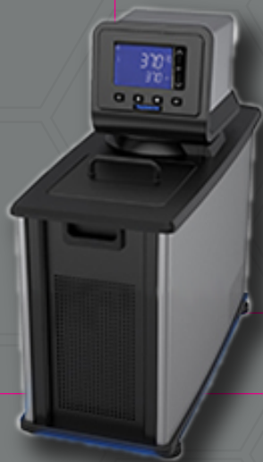
AD-20 7L Heater/chiller