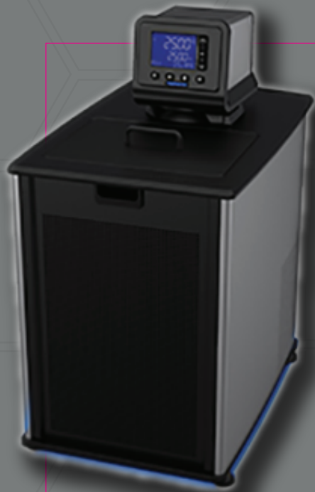
AD-40 15L Heater/Chiller