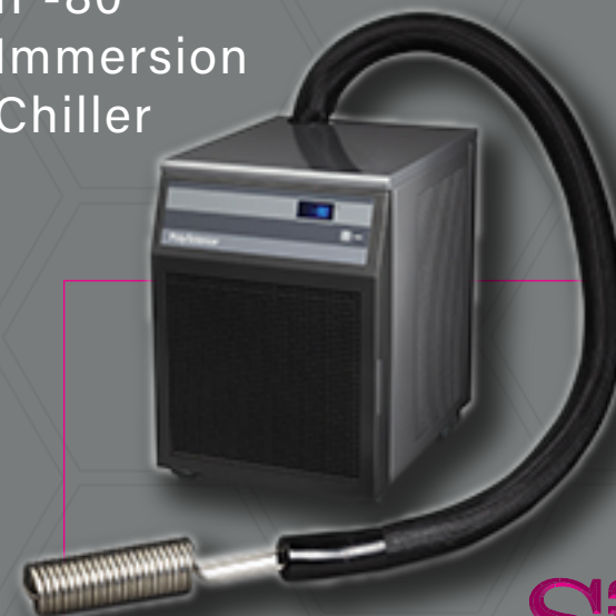
IP-80 Immersion Chiller