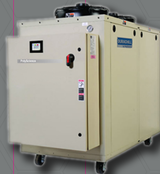
5 & 10HP DuraChill